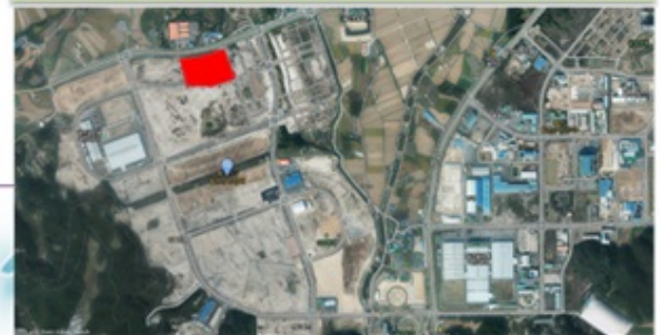
New cGMP Factory in Land Area of 19,582 m 2