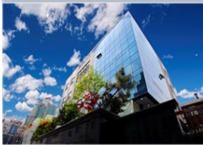
HQ and R&D Center (Seoul)